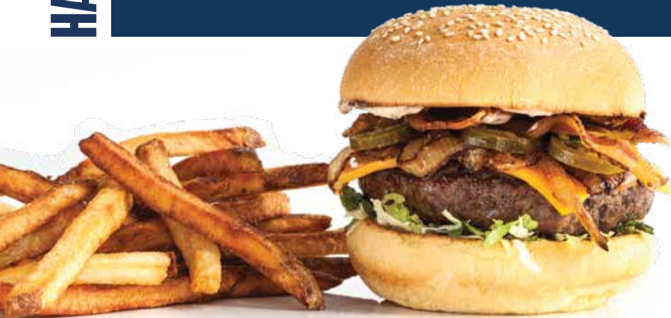
Bill's Burger with a side of fries

Burgers Grilled Medium (pink in the middle)