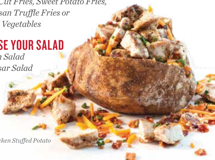
Chicken Stuffed Potato