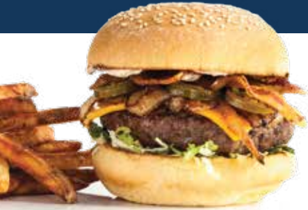
Burgers Grilled Medium (pink in the middle)